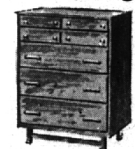
4-Drawer Chest 32", a real space saver for the small room, 47"

The group (as pictured above) shows how easy it is to accomplish so much in the way of decorative appeal without crowding.