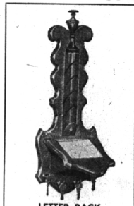
LETTER RACK Rich Maple Finish 4-DAY SPECIAL $8.95

BOOK CASE BED Create a "Fashion" magazine bedroom. $54.50