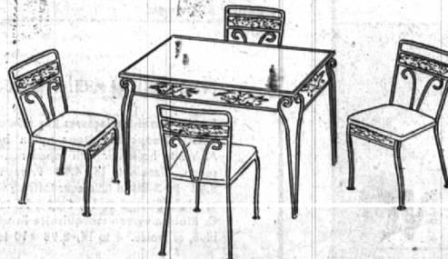
5-PIECE DINETTE $129.50

OPEN MONDAY, THURSDAY and FRIDAY EVENINGS 'TIL 9 CLOSED WEDNESDAYS