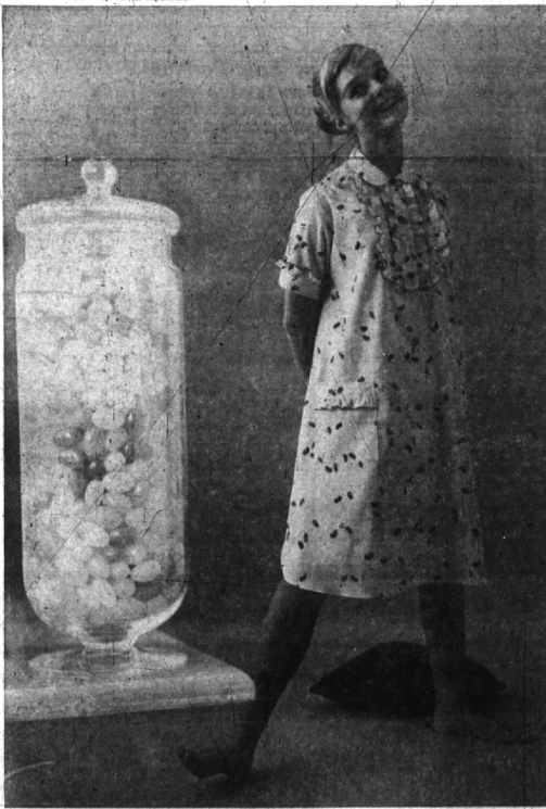
'Delicious' Sleep Fashion