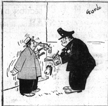
"Was he armed?"