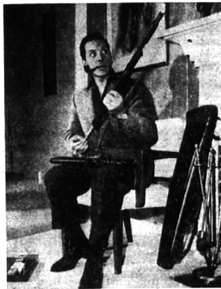
AND CASUAL but dressed right on a weekend while cleaning his favorite rifle.