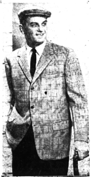
SPORT JACKET in ultra-lightweight British worsted, designed for comfort in the warmest weather, features an authentic Scottish district check.

In shoes for town, leading colors will be black, medium tan, teak brown, London tan, cardeu and dark maple. The mid-low oxford of three-to-four-eyelid height with a medium-broad toe will prevail.