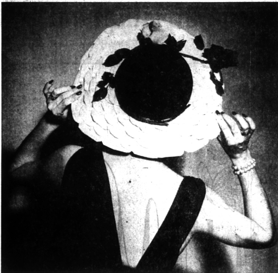
VIEWED from back or front, this picture hat is certain to charm. The black velvet crown is set off by a brim of white rough straw in a petal effect. Roses in red and pink give a touch of color. Photographed at Jacobson's.

277 Pierce Open Friday 'til 9:00 MI 6-4488