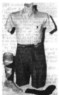
For the Dad who enjoys the comfort of casual living. Cool, lightweight in the finest of fabrics.

The one day of the year that the family can truly thank father with a Gift of Remembrance. We at Gwynn's have hand picked items that will please any Dad. We invite you to visit our store and take advantage of this outstanding selection.