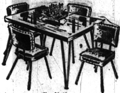
Style 8044 with Formica Top and Formica Edges