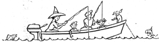
BIRMINGHAM—1185 S. Adams at Woodward