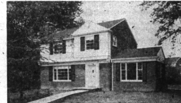
A house without enough storage space for the whole family is no bargain at any price. There are closets provided in this brand new colonial for all season wardrobes, linens, toys, tools, luggage, card tables. There's plenty of space to move around, too, when the rooms include . . .

Top construction was carefully supervised by the owner. Not only is the interior most distinctive, but in addition the site is breathtaking . . . a hilltop taking in the valley and a stream below. Landscaping is magnificent! The price of $60,000 is well below reproduction. Shown by appointment at your convenience.