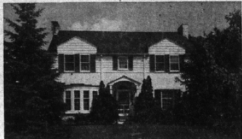
AUTHENTIC Colonial architecture to the nth degree. This gleaming white brick and frame home has nearly 40,000 cubic feet of living space.

4 bedrooms and 2 1/2 baths upstairs; also a first floor tiled lav. Bigger than usual living room and separate dining room. Both the recreation room and living room have fireplaces. Up-to-date kitchen with a charming bay window. Library. Two car attached garage. Screened porch opens off the living room.