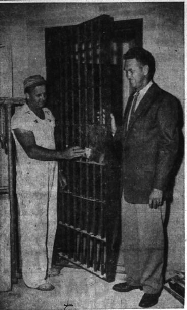
Just Passing Through