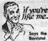
Says the Barrister