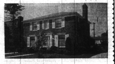
A Really Comfortable Home!

A charming Colonial and it's right in Birmingham. Just 3 yrs. old, it's comfortably settled with landscaping, garage, warm pine paneled library and it's newly decorated. • 3 Roomy Bedrooms • Full Basement • Large Living & Dining Room • Sparkling Kitchen • Cool Screened Porch • Aluminum storm sash & screens