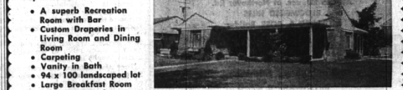
A Real Opportunity To Save at $30,500!

The owner of this charming Ranch type home is moving to the West and has asked us to sell at rock bottom price. There isn't space to detail all the charming features but they include— • A superb Recreation Room with Bar • Custom Draperies in Living Room and Dining Room • Carpeting • Vanity in Bath • 94 x 100 landscaped lot • Large Breakfast Room • Low Taxes and maintenance