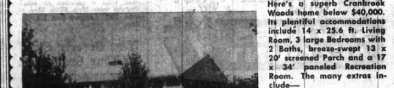
Exceptionally fine at $39,500!

Here's a superb Cranbrook Woods home below $40,000. Its plentiful accommodations include 14 x 25.6 ft. Living Room, 3 large Bedrooms with 2 Baths, breeze-swept 13 x 20' screened Porch and a 17 x 34' paneled Recreation Room. The many extras include— • Carpeting and draperies • Fine Interior Paneling of Birch, Cherry and Mahogany • 165 x 212 ft. Landscaped site