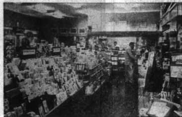
Interior of Store 1957