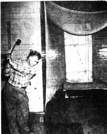
GETTING THAT much-needed exercise is this local golfer in the Birmingham gym driving range. This sport is part of the Recreation Department's extensive Adult Night Program.