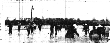
WITH THE COMING of colder weather, more and more winter sportsmen are taking part in Birmingham's extensive recreation program. Here skaters enjoy the facilities at Eton Park ice rink, where good crowds have been reported all season.

Two area schools have been named as the sites for the 1956-57 state basketball tournament. Birmingham will host the class A regional tournament while Southfield was selected as the site for the class B regional. Both tournaments are scheduled for March 12-16. Other details will be announced later.