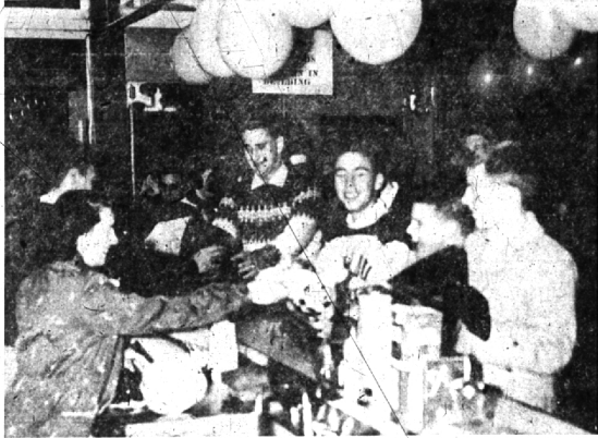
BIRMINGHAM CITY RECREATION DEPARTMENT gave two quite different New Year's Eve parties for the city's young people. At Birmingham's Eton park ice rink (above) young people crowd around the refreshment bar...