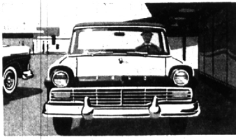
HANDLES LIKE A CAR! Ball-joint front suspension and outboard-mounted rear springs—first time on any pickup—give true passenger-car ride. Cab interior is exactly like that of the '57 Ford Ranch Wagon. Power steering, power brakes, power seat and power windows optional.

Looking at the boldly modern styling of the new Ford Ranchero, you may find it hard to believe that it's actually a man-sized truck, built to do a man-sized job. But it won't take you long to find there's a lot of heft behind the Ranchero's glamour.