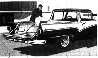
HAULS LIKE A TRUCK! No need to hold back on load. Pile it on—the Ranchero packs a greater payload than many standard pickups! Power-optional, too—Short Stroke 144-hp Six or either of two Short Stroke V-8's, up to 212 hp. Fordomatic or Overdrive optional.