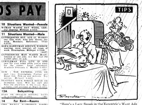
Here's a Lazy Susan in the Eccentric's Want Ads

17 For Rent--House & Apts. APARTMENT FOR RENT 3 ROOMS... MI 4-4928