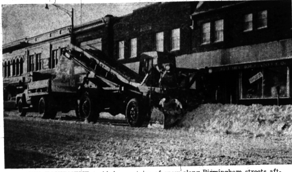
CITY EQUIPMENT tackled mountains of snow along Birmingham streets after last week's nine-inch blanketing. Here one of many truckloads of snow is loaded Thursday morning in the center of Woodward avenue, near Maple.