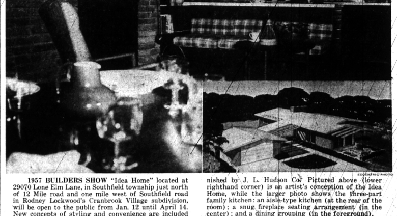
1957 BUILDERS SHOW "Idea Home" located at 29070 Lone Elm Lane, in Southfield township just north of 12 Mile road and one mile west of Southfield road in Rodney Lockwood's Cranbrook Village subdivision...

located at 29070 Lone Elm Lane, in Southfield township just north of 12 Mile road and one mile west of Southfield road in Rodney Lockwood's Cranbrook Village subdivision, will be open to the public from Jan. 12 until April 14. New concepts of styling and convenience are included in this year's idea home which is decorated and furnished by J. L. Hudson Co. Pictured above (lower right-hand corner) is an artist's conception of the Idea Home, while the larger photo shows the three-part family kitchen: an aisle-type kitchen (at the rear of the room); a snug fireplace seating arrangement (in the center); and a dining grouping (in the foreground).