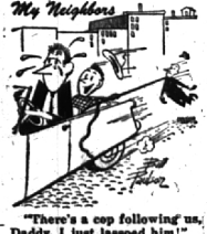
"There's a cop following us, Daddy, I just lassoed him!"