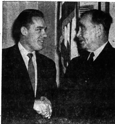
CONGRESSMAN WILLIAM S. BROOMFIELD, (R), is greeted by House GOP leader Joseph Martin (right) of Mass., just before the first session of the 85th Congress opened last week. Former member of Michigan's legislature, Broomfield last November was elected Oakland county's U. S. representative.

IRONRITE SALES & SERVICE 2365 N. Woodward (Near 11 1/2 Mile) LI 5-5500