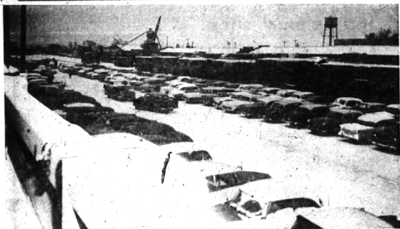
HUSBANDS WHO aren't driven to the station by their wives find the parking situation there tough when severe winter weather makes driving difficult. Then the "snowbirds" as commuters call them, who regularly drive every day, add theirs to the cars in the lot and take the train. Here motorists in background cruise in search of places to leave their cars before the train leaves.