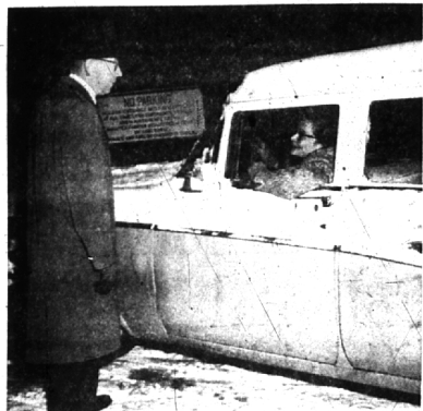
IN THE DARK of an early winter morning, typical scenes at the Birmingham station of the Grand Trunk Western railroad include many couples such as the one above saying "goodbye" as the husband heads for the train and the wife heads back home with the car.