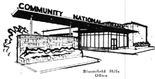
Bloomfield Hills Office West Long Lake Near Woodward Ave. Member F.D.I.C.

Our Bloomfield Hills Office is open Mondays — Tuesdays and Thursdays from 10 to 3 Wednesdays 10 to 12 Noon . . . Fridays 10 to 8 and Saturdays 9 to 12 Noon Enjoy these extra hours for Modern banking — Park and bank with Community where Thousands Save Millions