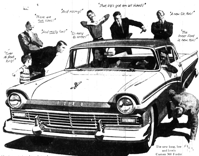
The new long, low and lovely Custom 300 Fordor

*Based on comparison of manufacturers' suggested retail delivered prices.