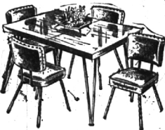
Size 30 x 48 with Formica Top and Formica Edger

Lifetime Guarantee On All Chrome 26 Styles — 26 Colors — All Stores