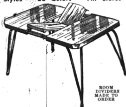
ROOM DIVIDERS MADE TO ORDER