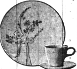
PETITE FLEUR (Multi-color on white)