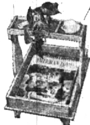
Magazine Rack $8.95

Anyone can make these antique, full-size reproductions without special skills or tools. The kits are complete with precise, pre-cut parts, pre-marked nail holes, a simple, rub-on finish, nails, knife, sandpaper, steel wool and other accessories. An ideal gift for Christmas!