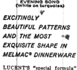
EVENING SONG (White on turquoise)

EXCITING BEAUTIFUL PATTERNS AND THE MOST EXQUISITE SHAPE IN MELMAC® DINNERWARE