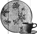
SUN PETAL (Yellow on white)