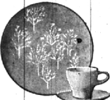
MORNING SONG (White on pink)