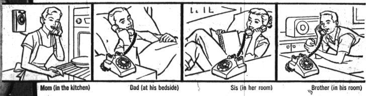
Mom (in the kitchen) Dad (at his bedside) Sis (in her room) Brother (in his room)

Someone in your family would like a telephone for Christmas