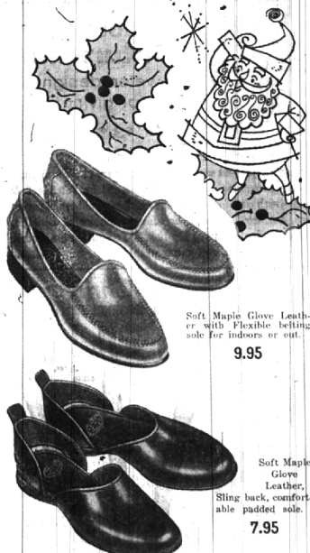
Soft Maple Glove Leather with Flexible belting sole for indoors or out. 9.95