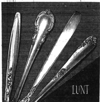
PATTERNS ILLUSTRATED: Summersong, Modern Victorian, Starrfire, Sweetheart Rose Place setting prices start at $32.75 6 pc.