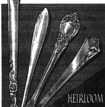
PATTERNS ILLUSTRATED: Silver Rose, Lasting Spring, Stanton Hall, Damask Rose Place setting prices start at $32.50 6 pc.