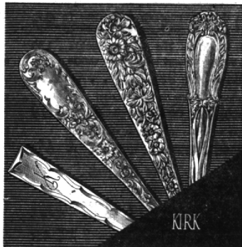
PATTERNS ILLUSTRATED: Skylark, Old Maryland—engraved, Repousse, Quadrielle Place setting prices start at $29.75 6 pc.