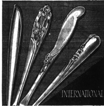
PATTERNS ILLUSTRATED: Silver Rhythm, Silver Iris, Silver Melody, Blossom Time Place setting prices start at $29.75 6 pc.

WOODWARD AT CORNER OF MAPLE PHONE MI 4-5315