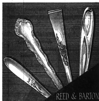
PATTERNS ILLUSTRATED: Autumn Leaves, Tara, Classic Rose, Silver Sculpture Place setting prices start at $29.75 6 pc.