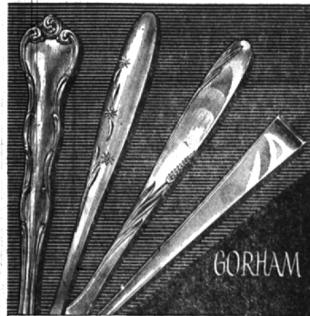
PATTERNS ILLUSTRATED: Rondo, Celeste, Willow, Theme Place setting prices start at $29.75 6 pc.