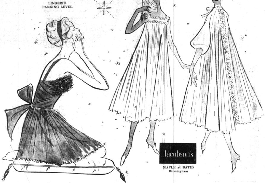
LINGERIE PARKING LEVEL

Christmas fanfare of pleats and imported lace on rich nylon tricot, by Gracette. left: bewitching short shortie pajamas. brief bloomer skirt; lace-ruffled bra wrap around sash. black, shocking pink, dior blue. 32 to 36. 12.98 center: waltz-length shift gown. blue, pink, white; white lace. s, m, l. 19.98 right: peignoir, lace front and back panels, puff sleeves. blue, pink, white. s, m. 29.98