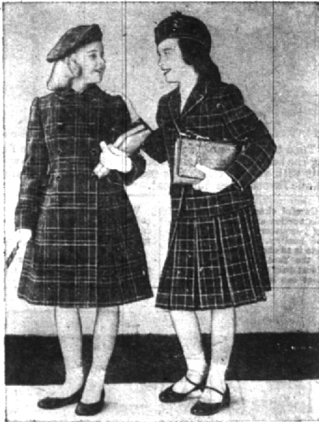
Lassies go off to school with light hearts, bright tartans. Blonde grammar girl prefers a double breasted coat with matching velvet collar, while her brunette friend likes a trim suit with pleated skirt. Both are authentic clan tartans in British woolsens.

And don't trust your child to tell you when the shoe is outgrown. Children are stoical about pain; they just don't notice it. So check regularly at the first of every month for any signs of wear on either the shoe or the foot.