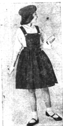
Classics are popular for back-to-school girls. "Chanel-look" outfit includes pleated skirt, striped jersey top, knee socks.

backs. Trousers have been whitened down without the sacrifice of comfort and thus give a trimmer appearance.