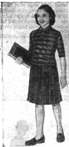
Co-Ed's choice for classroom smartness is this slim sheath and subtly striped jacket in heather tones.

among the most wanted sports jackets fabrics. These new fall cottons are heavier in weight than their summer cousins and darker in tone. Other favorites include corduroys and silk - and - wool blends. The corduroys, incidentally, can be had as sport coats, slacks, or in complete country suits.