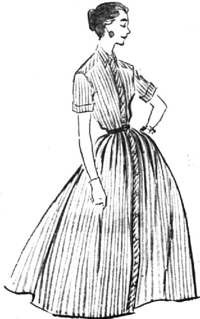
exciting shirt tale in dark cotton stripes $12.95

190 West Maple, Birmingham Lobby of Statler Hotel, Detroit 300 E. Lake Street, Petoskey