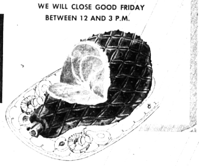
WE WILL CLOSE GOOD FRIDAY BETWEEN 12 AND 3 P.M.

Make Peabody's your one stop shopping center for that Easter feast. You can be sure of courteous, personal service at Peabody's and the added assurance that you'll be treating your family to the best when you shop here.