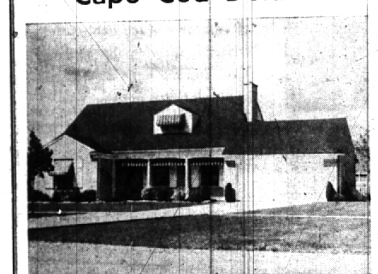
Beautiful surroundings near Oakland Hills