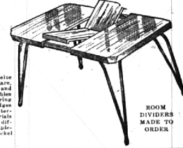
ROOM DIVIDERS MADE TO ORDER