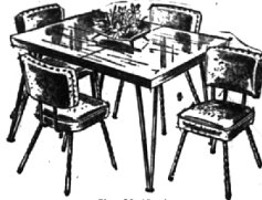
Size 36x48 with Formica Top and Formica Edges