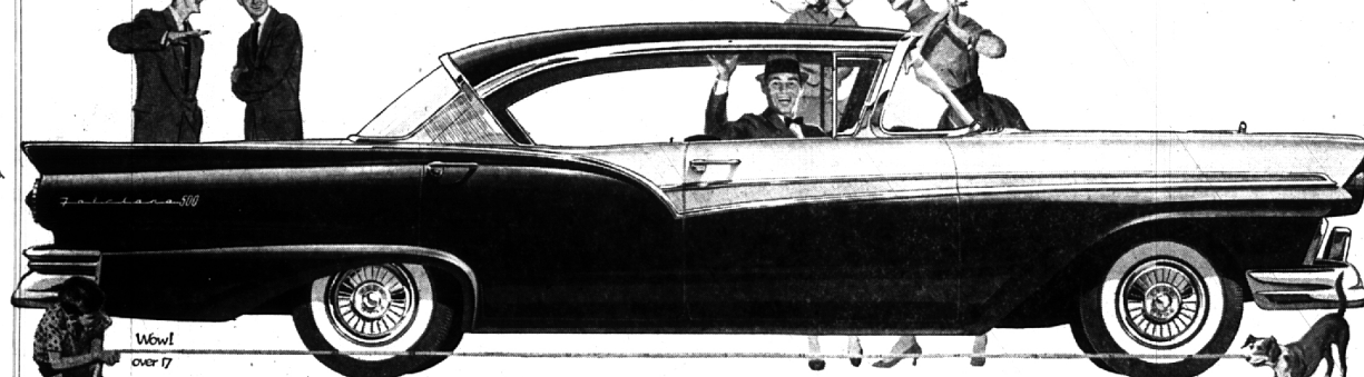
Wow! over 17