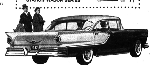
The Fairlane Fords for '57, like the Fairlane 500 models, have no equal... no counterpart, in the low-price field.

Turn to Turner—Your Friendly Ford Dealer