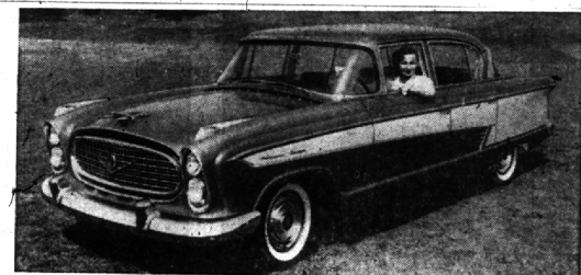
THE 1957 NASH , which is two inches lower than the 1956 model, is highlighted by a revolutionary four-headlight system. Powered by a new 255-horsepower V-8 engine, the new model also has "Lightning Streak" styling, a reduced turning diameter and "living room" interiors. Shown is the Nash Ambassador Custom four-door sedan. The new models go on sale in Nash dealerships across the nation on October 25.