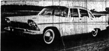
THE 1957 PLYMOUTH Belvedere four-door sedan has a low silhouette, long wheelbase, more powerful Fury 301 engine and revolutionary new Tor-sion-Aire ride—said to be the most important advancement in automobile design since the introduction of independent front suspensions.