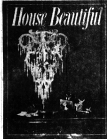
The dazzling gold and crystal "chandelier" is a Fan-out, hung by Golden Rope, lavishly sparkled with 48 plastic prisms. All this without rope, $12.50.