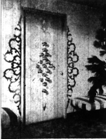
Four pairs of Golden Baroque Flat Scrolls (which may be purchased separately at $1.50 to $3.25 pair) combine to frame and accentuate a doorway.