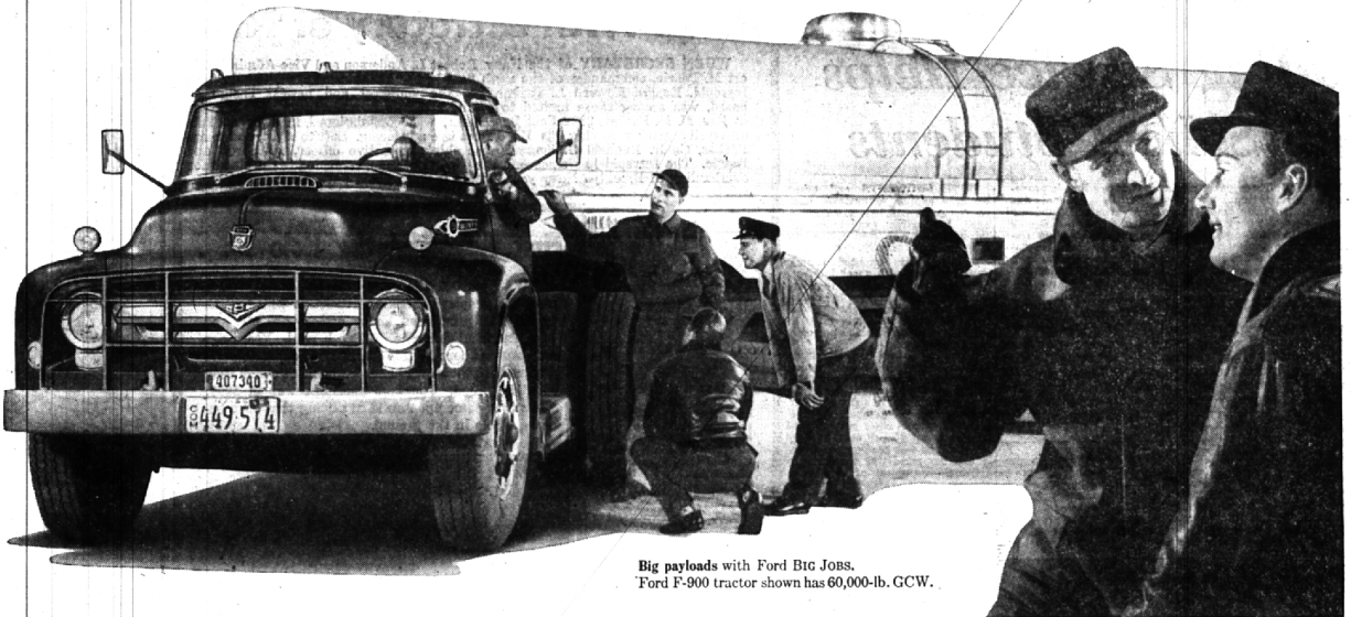
Big payloads with Ford Big Jobs. Ford F-900 tractor shown has 60,000-lb. GCW.

The use of yew and euonymus is prominent because of the shade. Old lilacs have been carefully trimmed of suckers and the "oriental" profile of interest remains. This rear garden has the charm of so many of our "downtown" locations, so quiet during the evening hours.