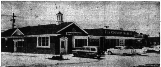
SALE PRICES END SATURDAY, NOV. 24

JELL-O Ten Delicious Flavors 4 Pkgs. 25¢