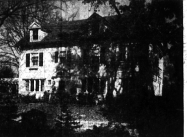
NEW HOME OF Birmingham's Unity Center after Jan. 1 will be the above residence at 1123 W. Maple, Birmingham. Plans are for the group to begin holding church school sessions for children after they occupy the larger quarters. Services are currently held at Birmingham YMCA at 11 a.m. each Sunday.

Harvest Home Dinner Slated A "Harvest home dinner" is scheduled at First Presbyterian church next Thursday at 6:30 p.m., sponsored by the Women's association.