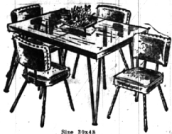
Size 30x48 with Formica Top and Formica Edges

Lifetime Guarantee On All Chrome 26 Styles — 26 Colors — All Stores