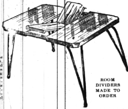
ROOM DIVIDERS MADE TO ORDER