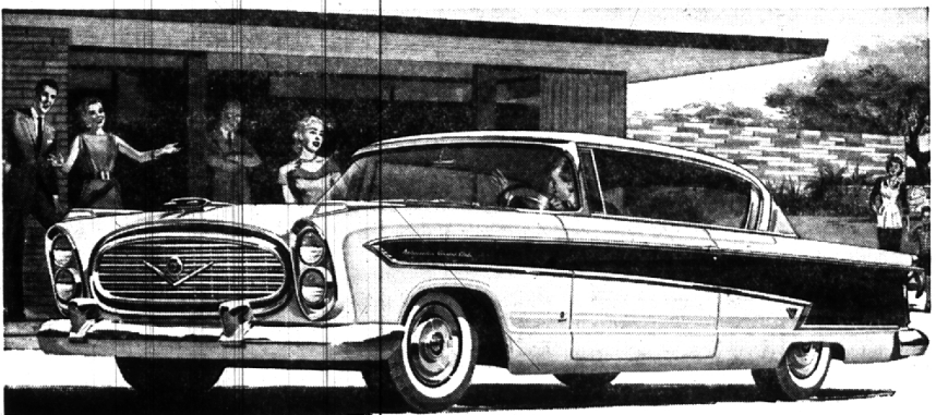
PRODUCT OF AMERICAN MOTORS

WHILE other prices go up—Nash prices go down. Nash power goes up—now 255 HP in the big, new long-wheelbase Nash Ambassador for 1957.