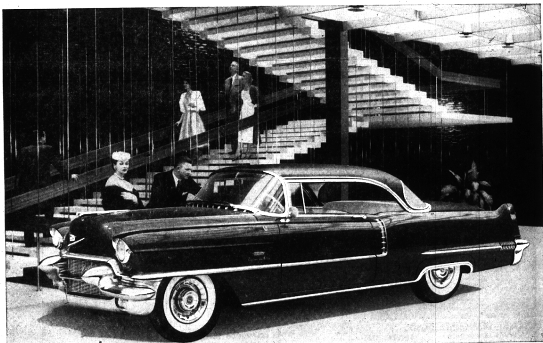
The 1956 Cadillac Coupe de Ville in the dramatically beautiful lobby of the new Styling Section at the General Motors Technical Center

Proudly Joins in Celebrating the Dedication of the GENERAL MOTORS TECHNICAL CENTER