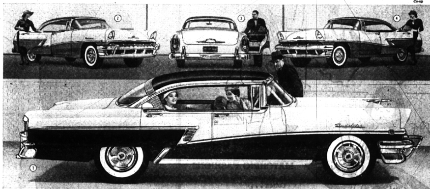
THE BIG M PHAETONS—Shown above (1) The Montclair, (2) The Monterey, (3) The Custom, and (4) The Medalist

Mercury offers you the newest, most advanced 4-door hardtop design with new, higher horsepower in every price range.*