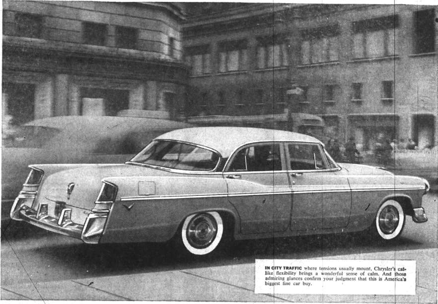
IN CITY TRAFFIC where tensions usually mount, Chrysler's cab-like flexibility brings a wonderful sense of calm. And those admiring glances confirm your judgment that this is America's biggest fine car buy.